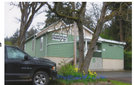
Strawberry Vale Community Hall

The Town of View Royal Archives can be contacted at: archives@viewroyal.ca or 250-708-2275. Please email or phone as we are unable to have visitors at this time. Submitted by View Royal Archives